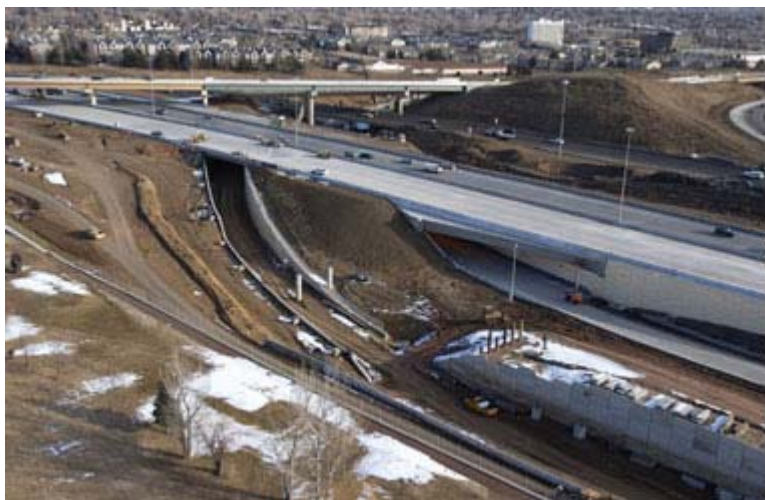
Gregg Gargan, Colorado DOT

Also, neighborhood associations, municipalities, and area businesses provided input through public meetings on design items, such as the light rail station and patterns for the sound walls.