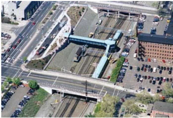
Aerial view of new commuter rail station at State Street, a component of the New Haven Harbor Crossing intermodal project.

FDOT will form other public-private partnerships to develop land acquired in the corridor and at the MIC core for hotels, offices, and retail space. The agency purchased a number of sites with existing buildings that will be demolished prior to constructing the roads and other components of the MIC. Tenants are remaining in these buildings and paying rent to FDOT until the time comes to clear the site for construction. "For the first time, FDOT is letting tenants occupy the sites purchased for the MIC and pay rent into a State account earmarked for the MIC until the site is demolished," says Adolfo Fassrainer, financial manager for FDOT.