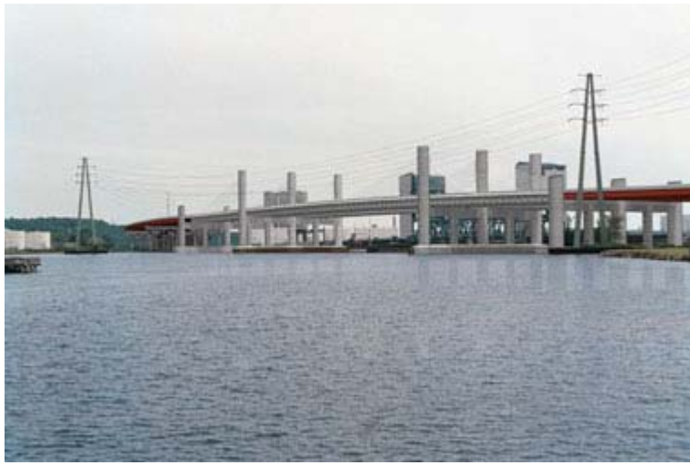
Rendering of the proposed new Pearl Harbor Memorial (Q) Bridge design in steel. The new bridge will be an extra doped bridge hybrid between a cable-stayed bridge and a box girder bridge. The lower towers avoid encroaching into the air space for the airport, just a mile away.