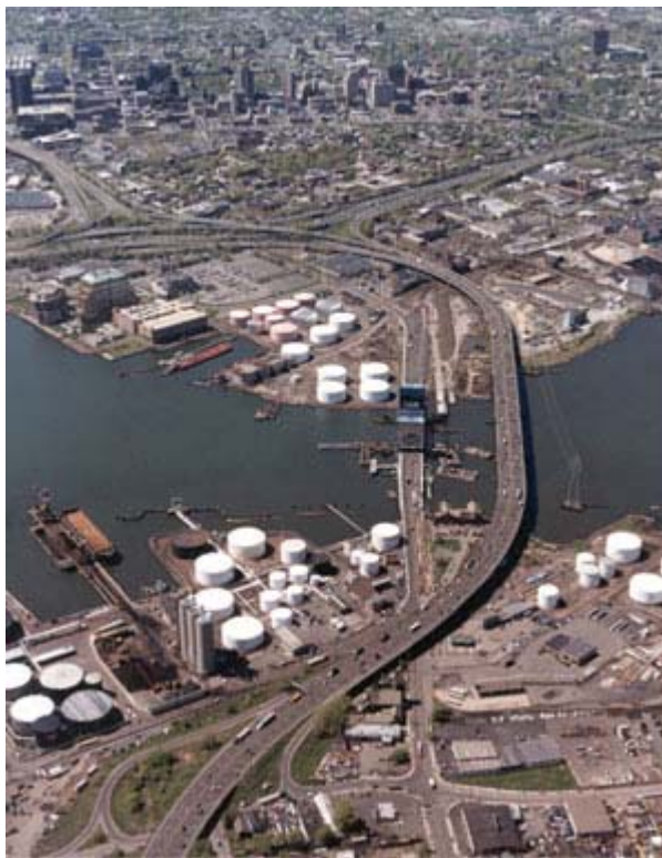
Aerial view of existing Pearl Harbor Memorial Bridge in New Haven, CT, showing the project's proximity to the city and port.

The $433 million TIFIA loan splits into two parts: $164 million for the rental car facility and $269 million for the other elements except for the airport connector. Since income from the rental car concessionaires will repay the loan for the rental car facility, USDOT required signed contracts with the several concessionaires as a condition of the loan. But when the contracts, which are now signed, lagged behind schedule, FDOT advanced funds to design the facility and start construction with site clearing, utilities, and foundations. FDOT also agreed to contribute $80 million for executing a money-saving redesign of the alignment for the airport connector and constructing the foundations in the shared corridor with the roadway.