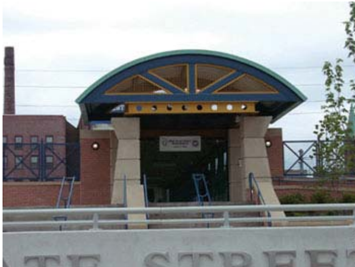
Entrance to the new commuter rail station at State Street. New Haven residents encouraged the project managers to complete this station prior to beginning construction on the highway component of the NHHC project to provide residents and commuters with an alternative means of accessing downtown.

As with T-REX in Colorado, effective interagency partnering and collaboration between public and private parties are essential to ensuring the success of the MIC project. In addition, breaking the work down into smaller phases and using innovative cost-sharing practices are helping the project proceed on schedule as realistic funding sources become available.