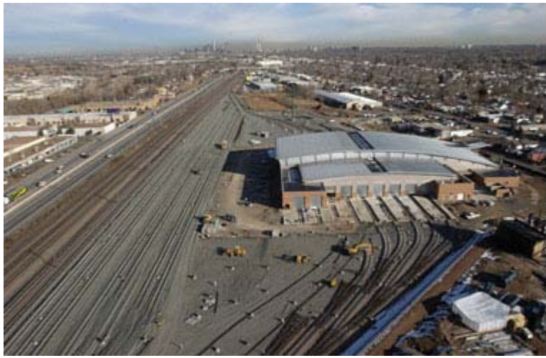
Gregg Gargan, Colorado DOT

Aerial view of the Elati light rail vehicle maintenance facility. The intermodal T-REX project in Colorado includes expanding highways and light rail transportation in the Denver, CO, area.