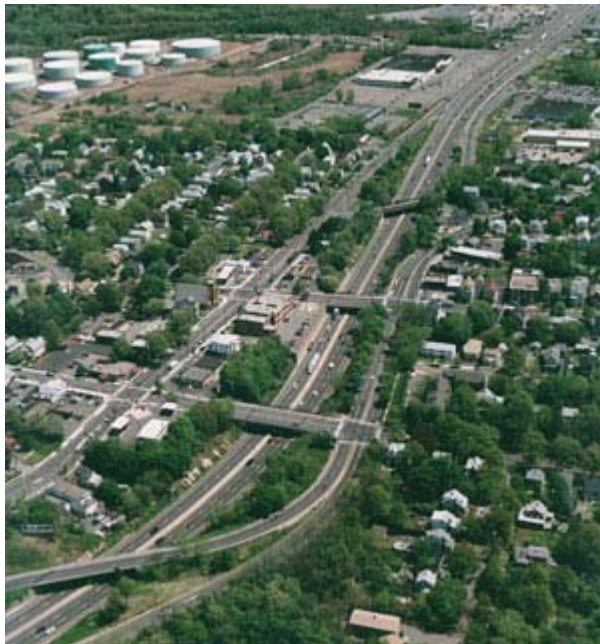
Rob Moore, Connecticut DOT

The design phase for the NHHC project will take more than 4 years to finish, while actual construction activities in the I-95 corridor will be ongoing for more than 11 years. The estimated completion date is scheduled for 2012.